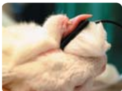
EVA Vet Plus Digital Sensor in position on a feline mandible.